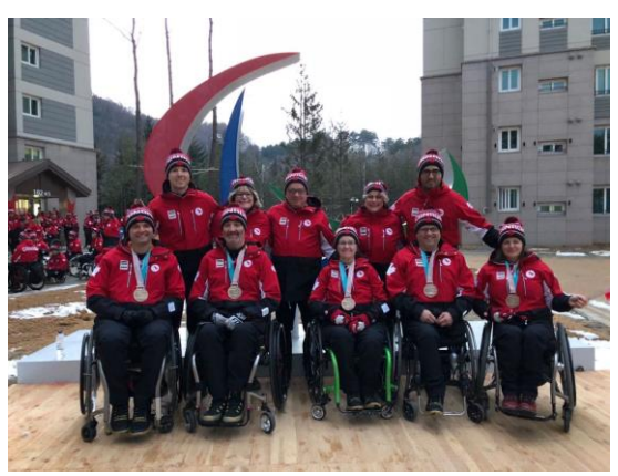
Bronze Medal curling team